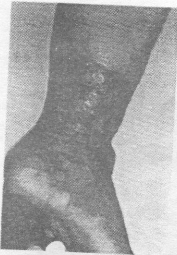
Fig (2a): Patient with LT LL chronic venous leg ulcer.