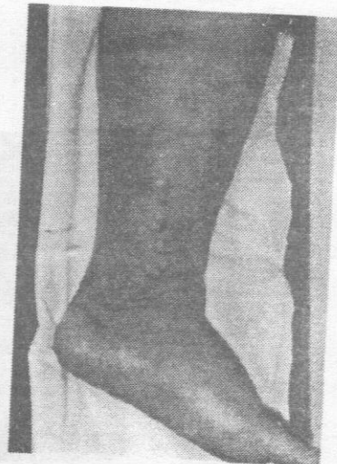
Fig (2b): Same patient 3 months after LSV striping and perforators ligation.