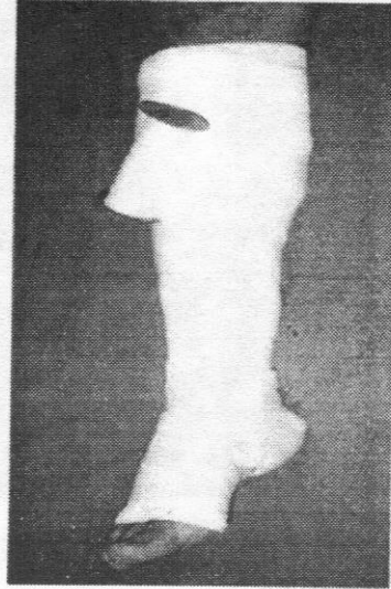
Fig (3b): Same limb after application of all layers.