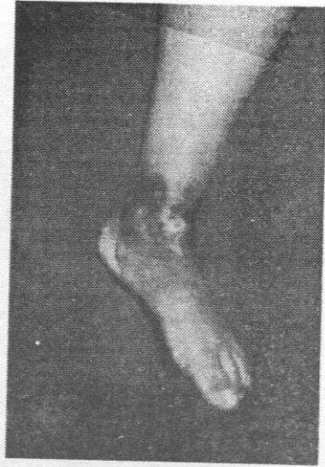
Fig (2b): Same patient 3 months after four-layer compression therapy show complete ulcer healing.