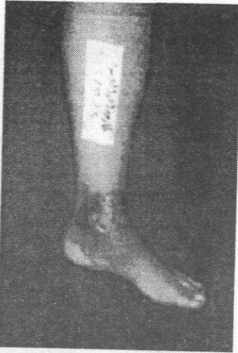
Fig (1a): Patient with Lt LL chronic venous leg ulcer.